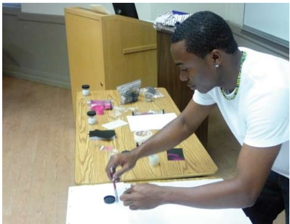
▲ LeadAmerica CSI camp: students learn forensic lab techniques, including blood sample analysis.