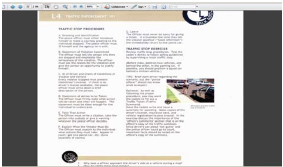
▲ JPA Cadets practice traffic stop procedures