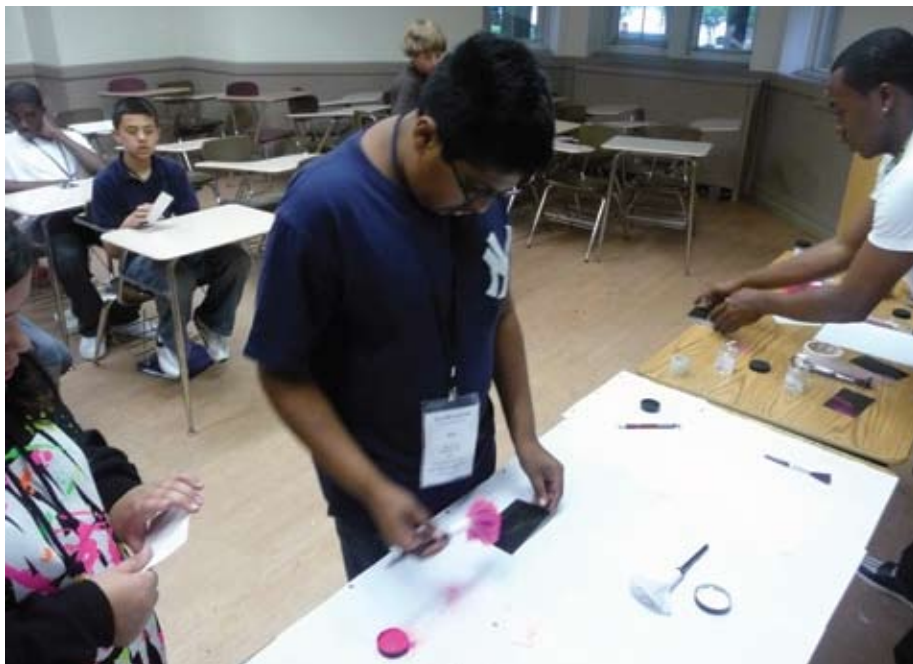
▲ LeadAmerica CSI camp: a high school student learns about fingerprint dusting and analysis.